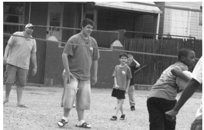
ENJOYING A GAME OF VOLLEYBALL DURING THE M.C.C.S. 10 YEAR CELEBRATION DAY

Our teachers and students are willing to come to present a program to your church on the ministry happening here at Mount Clare Christian School. Call us if you would like a visit from us! Telephone: 410 947-5981